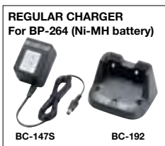
REGULAR CHARGER For BP-264 (Ni-MH battery)

* Tx: Rx: standby = 5:5:90. Power save function ON.