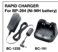
RAPID CHARGER For BP-264 (Ni-MH battery)

*1 BC-123SA/BC-147SA for 120V AC. SE for 230V AC. SV for 240V AC.