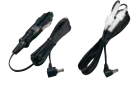
▲ CP-17L ▲ OPC-515L

CP-17L CIGARETTE LIGHTER CABLE, OPC-515L DC POWER CABLE For use with the BC-160 or BC-119N. (12–16V DC required).