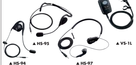
▲ HS-94 ▲ HS-95 ▲ HS-97 ▲ VS-1L

HS-94 : Earhook headset with flexible boom microphone. HS-95 : Behind-the-head headset with flexible boom microphone. HS-97 : Throat microphone fits around your neck and picks up speech vibration. VS-1L : PTT/VOX unit. Required when using these headsets with the transceiver.