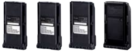
▲ BP-230 ▲ BP-231 ▲ BP-232 ▲ BP-240