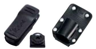
▲ MB-93 ▲ MB-96F

MB-93 : Swivel type belt clip. MB-94 : Alligator type. Same as supplied. MB-96N : Swivel type belt hanger. MB-96F : Fixed type belt hanger.