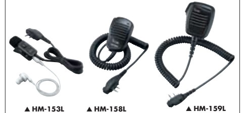
▲ HM-153L ▲ HM-158L ▲ HM-159L

HM-153L : Durable earphone-microphone with revolving clip. HM-158L : Compact and durable body with screw-type connector. HM-159L : Full size durable speaker microphone.