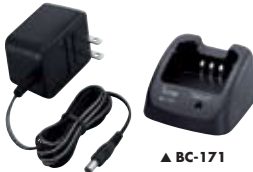
▲ BC-147 ▲ BC-171

BC-171 DESKTOP CHARGER + BC-147 AC ADAPTER Charges the battery pack in 8–10 hours (approx.). Coming soon.