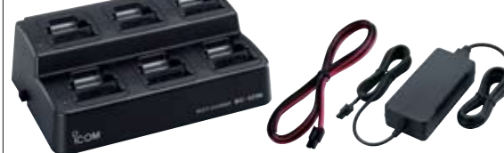
▲ BC-121N+AD-106 (6 pcs.) ▲ OPC-656 ▲ BC-157

BC-121N MULTI-CHARGER + AD-106 CHARGER ADAPTER + BC-157 AC ADAPTER (Six AD-106s are required) Charges up to 6 battery packs in 2 hours (approx.) when BP-231 is attached.