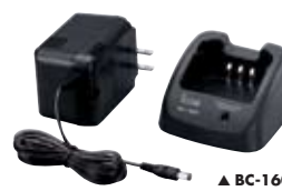
▲ BC-145 ▲ BC-160

BC-160 DESKTOP CHARGER + BC-145 AC ADAPTER Charges the BP-231 in 2 hours (approx.). BC-119N + AD-106 + BC-145 is also available. : Charges the BP-231 in 2 hours (approx.).